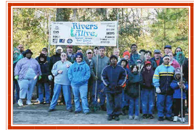
Ochlockonee River Basin Thomasville

Funding for this brochure was provided in part through a grant from U.S. Environmental Protection Agency under the provisions of Section 319 (h) of the Federal Clean Water Act.