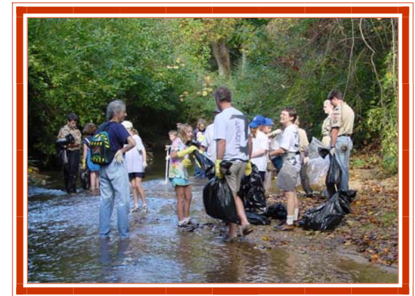
Chattahoochee River Basin Atlanta