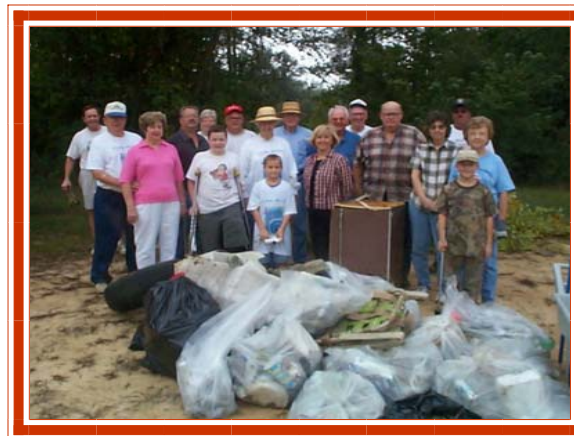
Oconee River Basin Dublin

Georgia's 70,150 miles of streams and rivers need your help! Our waterways provide us with fresh drinking water, great recreational opportunities like canoeing and fishing, and they serve as a pleasant respite from our busy day to day lives. Everyone contributes to pollution in our streams. This is your opportunity to help by giving something back to the environment! Help us clean our rivers, streams, lakes, beaches and wetlands by supporting Rivers Alive!