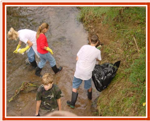
Chattahoochee River Basin Helen

Georgia Adopt-A-Stream Environmental Protection Division Water Protection Branch 4220 International Parkway, Suite 101 Atlanta, GA 30354