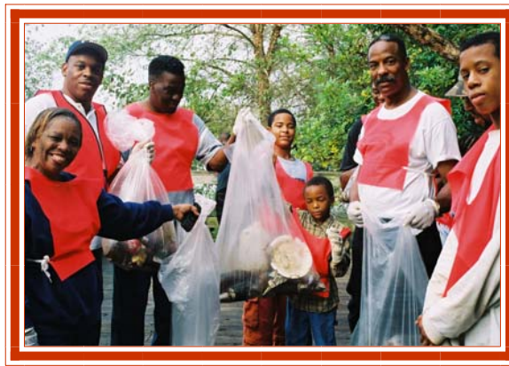
Chattahoochee River Basin Roswell